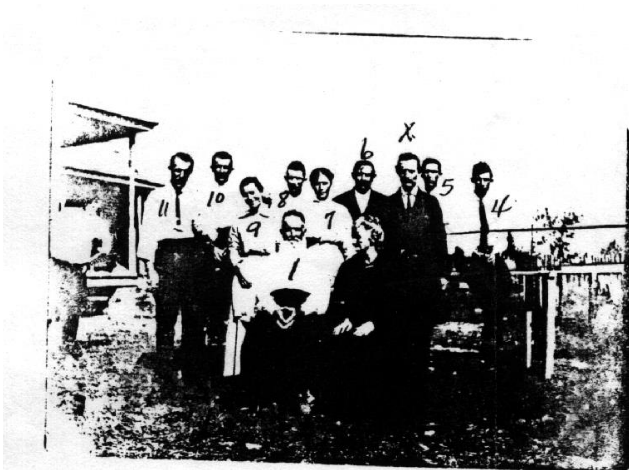
Abt 1910 FAMILY Portrait